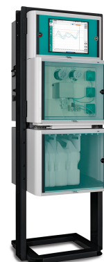
Figure 3. 2060 VA Process Analyzer from Metrohm Process Analytics.

Employing voltammetric determination, the 2060 VA Process Analyzer (Figure 3) operates fully automatically. It also features an alarm system that notifies plant personnel when any of the monitored heavy metals approach the limit values. This timely alert enables the introduction of ion exchanger regeneration or other strategies for mitigation, effectively preventing limit value breaches.