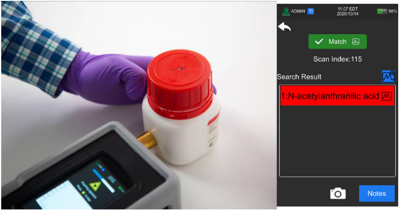
Figure 4. TacticID-1064 ST measurement through HDPE bottle and match result for N-acetylanthranilic acid

Caffeine in a white plastic bottle was placed inside a white padded shipping package for analysis (Figure 5). In this case, the caffeine must be identified through both the plastic and the padded package.