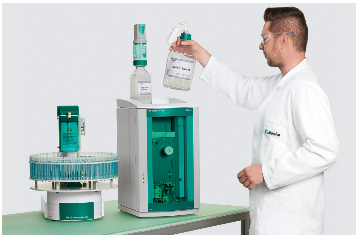
Figure 1. Instrumental setup including a 930 Compact IC Flex, 919 IC Autosampler plus, and an 800 Dosino for automatic regeneration of the Metrohm Suppressor Module (MSM).

into the IC using a 919 IC Autosampler plus (Figure 1).