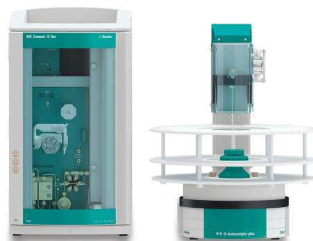
Figure 1 Instrumental setup including a 930 Compact IC Flex with IC Conductivity Detector (L) and the 919 IC Autosampler plus (R).

Anionic components were isocratically separated on a Metrosep A Supp 17 - 150/4.0 column, which contains the alternative packing material L91. The conductivity signal was detected after sequential suppression. For the column equivalency, system suitability (e.g., repeatability, tailing factors) and sample recoveries were studied ( Table 2 ).