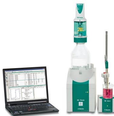
Figure 1. 907 Titrando with tiamo. Exemplary setup for the photometric determination of zinc sulfate purity.

An appropriate amount of sample is weighed into a beaker and is dissolved in deionized water. Ammonia buffer pH 10 and a small amount of Eriochrome Black T indicator is then added to the beaker. The sample is titrated photometrically with standardized EDTA until after the break point.