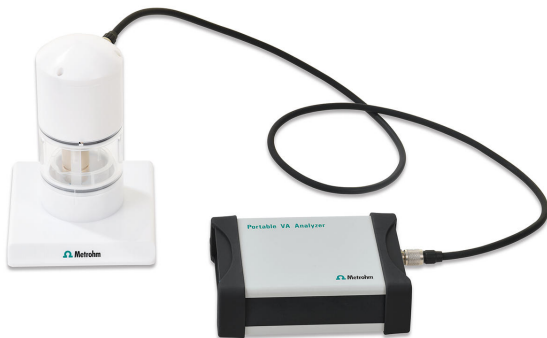
Portable VA Analyzer (SPE) Portable metal analyzer for the determination of heavy metals. Device version for screen-printed electrodes (SPE). The system is comprised of potentiostat and separate measuring stand with integrated stirrer and replaceable electrode. The instrument is operated with the Portable VA Analyzer software. The power is supplied via the USB connector and via the integrated rechargeable battery. The device is supplied with all required accessories in a carrying case. Screen-printed electrodes are not included in the scope of delivery.