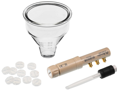
VA accessory equipment with SPE electrode shaft for professional VA instruments Accessory equipment for use with screen-printed electrodes (SPE). Contains electrode shaft for screen-printed electrodes, stirrer, and measuring vessel. Without electrodes.