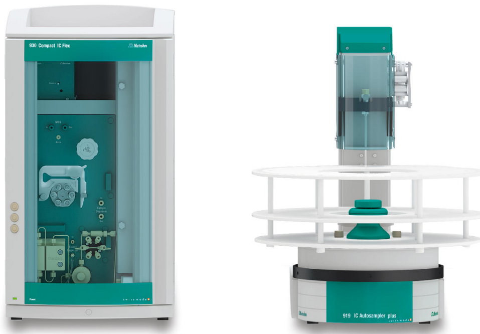
Figure 1. Instrumental setup including a 930 Compact IC Flex with the IC Conductivity Detector MB (L) and the 919 IC Autosampler plus (R).

Anhydrous salts from different manufacturers were used.