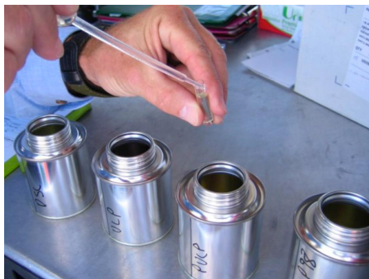
Figure 1. Samples filled in disposable vials with 8 mm path length.

99 pygas samples were analyzed on a NIRS XDS RapidLiquid Analyzer equipped with 8 mm disposable glass vials. All measurements were performed in transmission mode from 400 nm to 2500 nm. The temperature control was set to 40 °C, to provide a stable sample environment. For convenience reasons disposable vials with a path length of 8 mm were used, which made a cleaning procedure obsolete. The Metrohm software package Vision Air Complete was used for data acquisition and prediction model development.