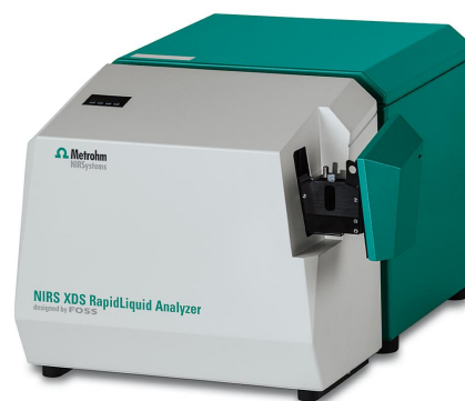
Figure 1. The NIRS XDS RapidLiquid Analyzer with a 1 mm quartz cuvette, used to collect the spectra of surfactant samples.

A total of 37 samples with varying surfactant content were provided by a customer. The Vis-NIR spectra (Figure 2) were acquired on a Metrohm NIRS XDS RapidLiquid Analyzer equipped with 1 mm quartz cuvette (Figure 1). The samples were measured as-is, without any sample preparation steps. Data collection and model development was carried out with the Vision Air complete software package.