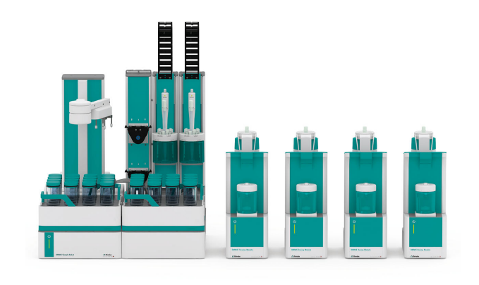
Figure 1. The OMNIS Sample Robot S equipped with an OMNIS Professional Titrator, plus a corresponding amount of OMNIS Dosing Modules to add all necessary solutions, and dPt Titrode for the automated determination of iodine value.

An appropriate amount of sample is weighed into the titration beaker, then the beaker is covered with a lid and placed on the sample rack. Before the titration, glacial acetic acid, Wijs solution (ICI), and magnesium acetate solution are added, and the solution is stirred for five minutes. Afterwards, potassium iodide solution is added, and the solution is titrated with standardized sodium thiosulfate until after the equivalence point.