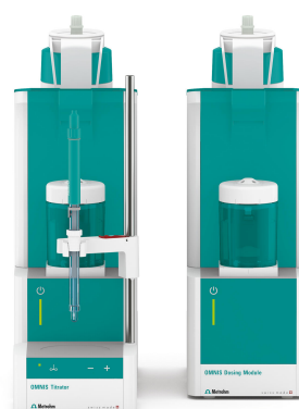
Figure 1. OMNIS system for the measurement of saponification value in edible oils consisting of an OMNIS Advanced Titrator and an OMNIS Dosing Module equipped with a dSolvotrode.

The prepared sample solution is first allowed to cool down to room temperature. Next, the buret tips as well as the electrode are inserted into the conical flask. Ethanol is added, and then the solution is titrated with standardized hydrochloric acid until after the equivalence point is reached. Afterwards, the electrode is cleaned with ethanol and deionized water. The electrode is then conditioned by immersing the bulb alone in deionized water for 1 minute.