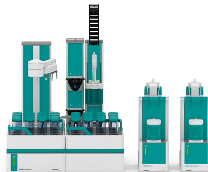
Figure 1. Fully automated OMNIS system for the determination of acid value in edible oils.

To a reasonable amount of sample, a solvent mixture consisting of ethanol and diethyl ether is automatically added, and the solution is stirred for one minute to dissolve the sample. Afterwards, the sample is titrated with standardized ethanolic KOH until after the equivalence point.