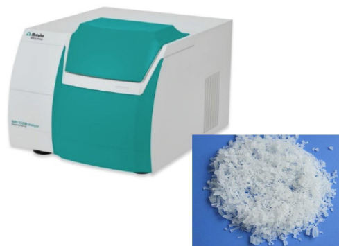
Figure 1. The DS2500 Solid Analyzer was used to collect the spectra of PVA polymer.

54 spectra from 18 different sample batches were collected using a Metrohm DS2500 Solid Analyzer in combination with the Vision Air Complete spectroscopy software. To overcome sample inhomogeneity, the measurement was performed with a large sample cup in rotation. The reference values were obtained by titration. Outlier detection was performed on pre-processed spectra (2 nd derivative) using a maximum distance in wavelength space algorithm. The NIRS prediction model was created with the settings described in the following table, and validated using cross validation.