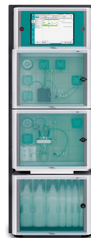
Figure 2. 2060 Process Analyzer for online analysis of ammonia and hydrogen sulfide in the sour water stripping process.

The 2060 Process Analyzer can analyze H 2 S and NH 3 simultaneously with automatic cleaning and calibration steps using absolute wet chemical techniques. Sulfide (S 2- ) is determined by a precipitation titration with silver nitrate (AgNO 3 ). Ammonia is determined by Dynamic Standard Addition (DSA). Fast and accurate results are continuously transmitted to the programmable logic controller (PLC) for process control.