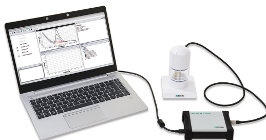
Figure 1. 946 Portable VA Analyzer (SPE)

Prior to the first determination, an ex-situ bismuth film is deposited from a Bi solution. In the next step, the electrodes are cleaned with ultrapure water and the bismuth solution is removed. The water sample is placed into the measuring vessel. Ammonia / ammonium chloride buffer along with the complexing agent (dimethylglyoxime) are added, and the simultaneous determination of nickel and cobalt is carried out using the parameters specified in Table 1 . The concentration is determined by two additions of a nickel and cobalt standard addition solution.