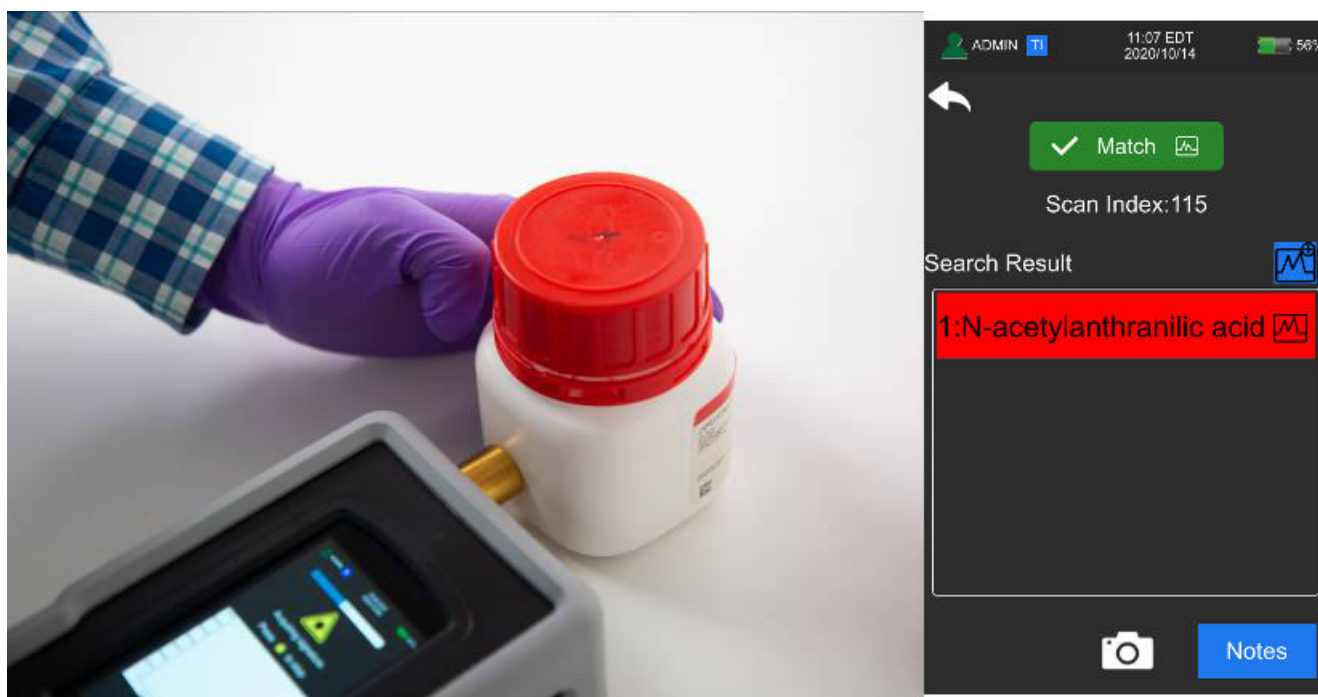
Figure 4. TacticID-1064 ST measurement through HDPE bottle and match result for N-acetylanthranilic acid

Caffeine in a white plastic bottle was placed inside a white padded shipping package for analysis (Figure 5). In this case, the caffeine must be identified through both the plastic and the padded package.