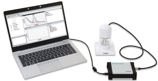
Figure 1. 946 Portable VA Analyzer (SPE)

Prior to the first determination, an ex-situ bismuth film is deposited from a Bi solution. In the next step, the electrodes are cleaned with ultrapure water and the bismuth solution is removed. The water sample is placed into the measuring vessel. Ammonia / ammonium chloride buffer along with the complexing agent (dimethylglyoxime) are added, and the simultaneous determination of nickel and cobalt is carried out using the parameters specified in Table 1 . The concentration is determined by two additions of a nickel and cobalt standard addition solution.