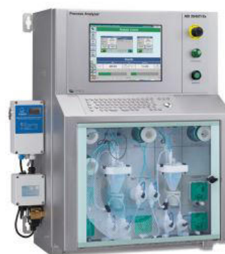
Figure 2. ADI 2045TI Ex proof (ATEX) Analyzer.

Chloride is analyzed with conductivity detection as described in ASTM D3230 with the ADI 2045TI Ex proof Analyzer (Figure 2).