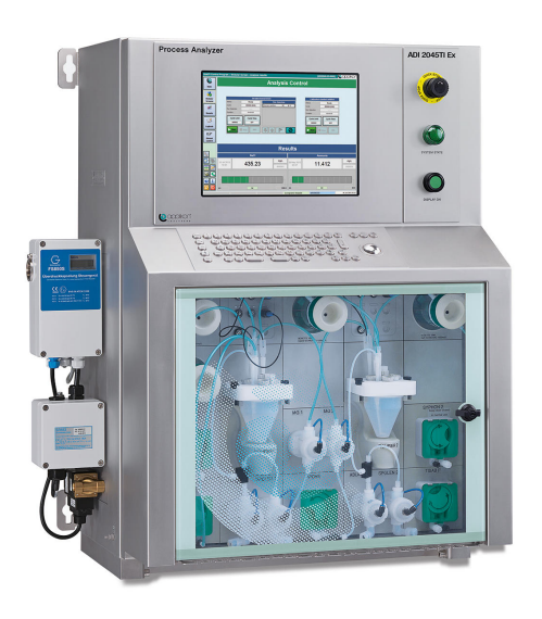
Figure 2. The 2045TI Ex proof Process Analyzer is certified for Zone 1 and Zone 2 areas.

further on in the distillation unit. The analyzer fulfills EU Directives 94/9/EC (ATEX95) and is certified for Zone 1 and Zone 2 areas.