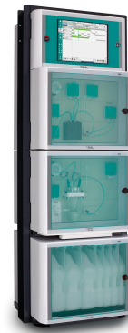
Figure 2. 2060 Process Analyzer from Metrohm for online monitoring of hydrogen peroxide during the CMP process.

Other combinations of measurements, as well as measurement points taken from a single process stream or even multiple streams, can be realized across the Metrohm Process Analytics product portfolio. All platforms guarantee fast, accurate results continuously available for true process control.