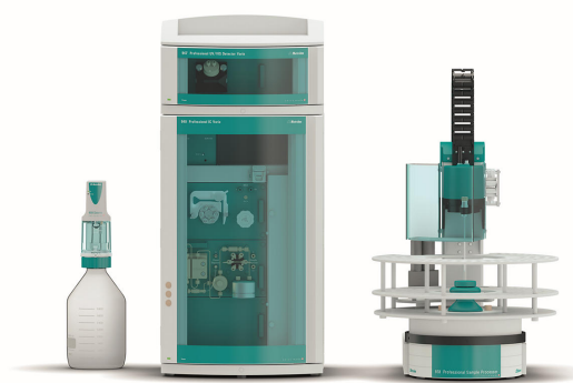
Figure 1. Instrumental setup including a 940 Professional IC Vario (center), 947 Professional UV/VIS Detector Vario SW (top center), 858 Professional Sample Processor (right), and MiPCT-ME, performed with the Metrosep A PCC 2 HC/4.0 and a Dosino (left).

Anionic components were isocratically separated on a Metrosep A Supp 10 - 250/4.0 column and the background was reduced to a minimum with sequential suppression. The UV/VIS detector signal at 215 nm was recorded. The total run time was 40 minutes. The method accuracy was confirmed by a study where samples were spiked with 4 µg/L NO 2 - and the recovery values were evaluated.