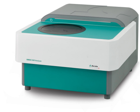
Figure 1. The OMNIS NIR Analyzer Solid from Metrohm.

In this study, samples of lactose with varying water content were analyzed to create a NIRs prediction model for quantification. Lactose monohydrate samples either spiked with water or dried in an oven were measured on an OMNIS NIR Analyzer (Figure 1) in reflection mode (1000–2250 nm) in 19 mm vials using a flexible holder. Single measurement was selected as the measuring mode. Data acquisition and prediction model development were performed with OMNIS software.