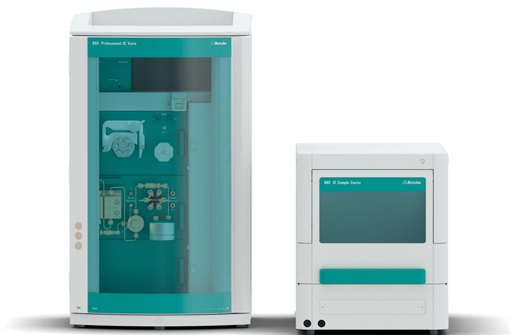
Figure 1. Instrumental setup including a 940 Professional IC Vario ONE/SeS/PP, IC Conductivity Detector (L) and the 889 IC Sample Center (R).

subsequently analyzed with a 940 Professional IC Vario using the method parameters given in the respective USP monograph ( Table 1 ).