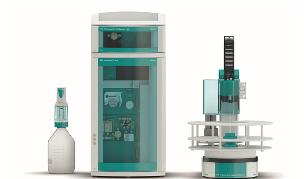
Figure 1. Instrumental setup including a 940 Professional IC Vario (center), 947 Professional UV/VIS Detector Vario SW (top center), 858 Professional Sample Processor (right), and MiPCT-ME, performed with the Metrosep A PCC 2 HC/4.0 and a Dosino (left).

A single-point calibration was used with 4 µg/L NO 2 - prepared from a 1000 mg/L NIST certified standard (Sigma TraceCERT No. 67276).