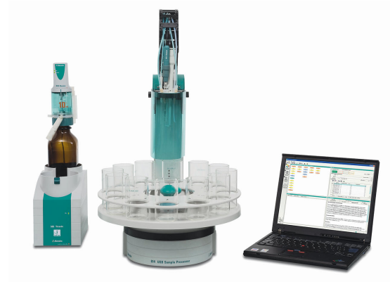
Figure 1. Titrando system consisting of an 814 USB Sample Changer in combination with a 907 Titrando and tiamo.

The blank is determined in the same way, but by omitting the sample.