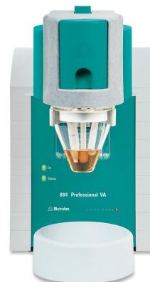
Figure 1. 884 Professional VA.

Sample preparation and the determination of iodine is carried out according to the USP monograph «Thyroid Tablets». The process involves dry ashing of the tablets, where organically bound iodine is released and later converted to iodate. The iodate content is determined with the 884 Professional VA (Figure 1) by differential pulse polarography.