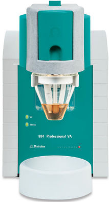
Figure 1. 884 Professional VA.

Sample preparation and the determination of iodine is carried out according to the USP monograph «Thyroid Tablets». The process involves dry ashing of the tablets, where organically bound iodine is released and later converted to iodate. The iodate content is determined with the 884 Professional VA (Figure 1) by differential pulse polarography.