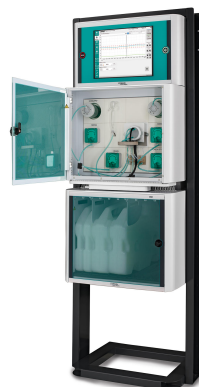
Figure 3. 2060 XRF Process Analyzer.

Incorporating both analysis techniques (i.e., titration/photometry and XRF) in the 2060 XRF Process Analyzer offers users a comprehensive solution for monitoring cyanide levels and metal concentrations in the gold recovery process. This integration enhances plant safety, ensures full recoveries of cyanide from complex solutions, and accelerates return on investment (ROI) by consolidating both methods into one analyzer, thereby reducing footprint and operational costs.