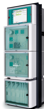
Figure 2. 2060 TI Process Analyzer.

dangerous (due to cyanide toxicity), and prone to human error, leading to potential inaccuracies in the measurements. Additionally, the intermittent nature of manual sampling may fail to capture sudden fluctuations in cyanide concentrations, potentially compromising process control and environmental compliance. By integrating online process analyzers into the refinery, operators can quickly check the cyanide levels in the leaching process and in the wastewater effluent. This helps them make corrections to improve efficiency and reduce harm to the environment.