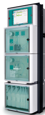
Figure 3. The 2060 TI Process Analyzer from Metrohm Process Analytics can monitor several critical parameters online in the anodizing process.

Online monitoring of the alkaline and acidic components as well as aluminum by titration is possible with the 2060 TI Process Analyzer ( Figure 3 ) or the 2026 HD Titrolyzer ( Figure 4 ) from Metrohm Process Analytics. The selection of the optimal process analyzer depends on the specific monitoring requirements (multiparameter or single parameter, respectively).