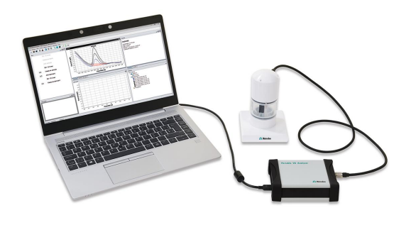
Figure 1. 946 Portable VA Analyzer

The scTRACE Gold is electrochemically activated prior to the first determination.