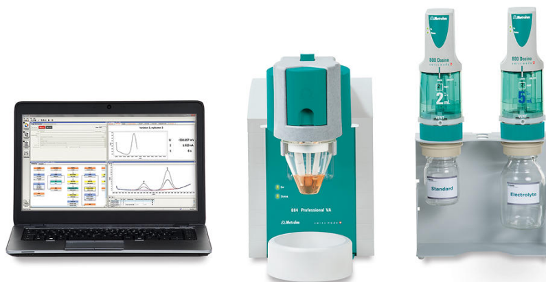
Figure 2. 884 Professional VA, semiautomated for VA analysis